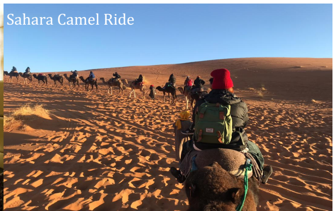
Sahara Camel Ride