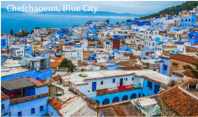
Chefchaouen, Blue City