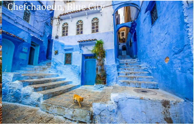
Chefchaouen, Blue City