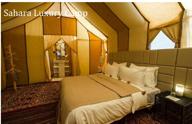
Sahara Luxury Camp

Early morning after breakfast we will depart for the mysterious desert. A relaxing time in the cool highland of Infrane. Photo stop for beautiful Ziz Valley, oasis and Berber's house in a raw rocky plain. We will stop at Midelt for lunch and continue our journey to Merzouga for a sunset camel ride . Experience the trek while riding slowly crossing dunes and accompanied only by silent and calmness as you watch the day go by and be replaced by the darkness of the night. Feel your path illuminated by the clear sky of tiny sparking stars as the compass to your camp of the night. Upon reaching the camp, you may refresh yourself and a traditional Berber's dinner will be served. Enjoy the warmth of the campfire together with the drumming performance from the Berber's tribe.